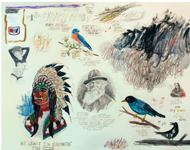
Wes Lang The High Low And In Between Teknik: Mixed Media on Paper År: 2011