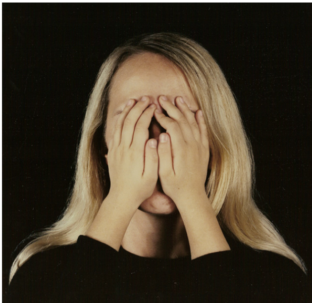
Anneè Olofsson Hide and Seek Teknik: C-print on aluminum År: 2010

This material is provided exclusively for use in connection with articles about MARKET