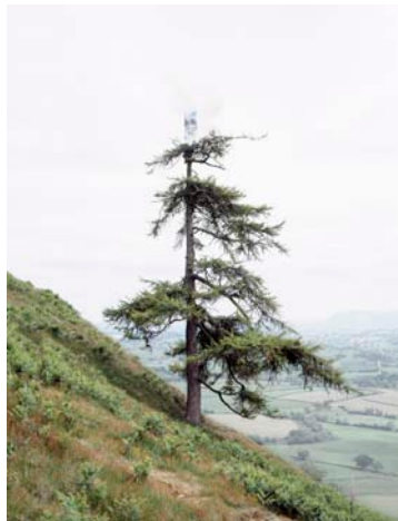
Axel Antas Wanderer from series Obstructed view Teknik: C-print År: 2010