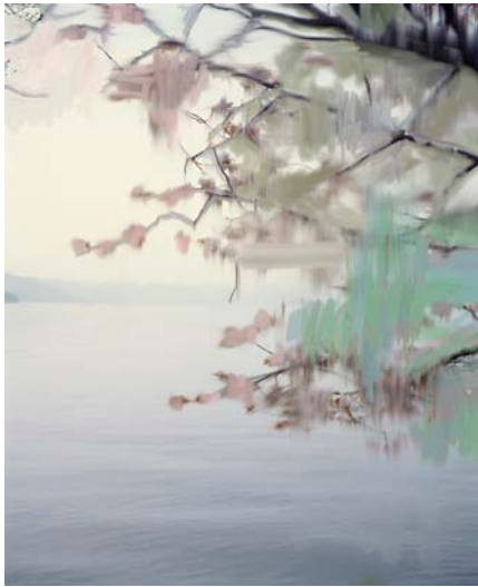
Sandra Kantanen Untitled (Sakura 3) Teknik: Pigment print on aluminum År: 2010