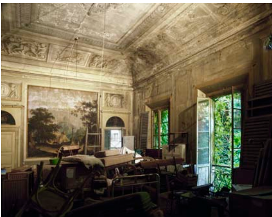
Hyun-Jin Kwak Grand 2 - A View Of The Alps Teknik: Digital C-print År: 2011 Courtesy of Peter Lav Gallery