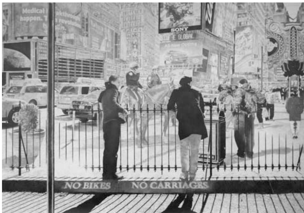
Fredrik Hofwander Two States Teknik: Graphite on paper År: 2011-12