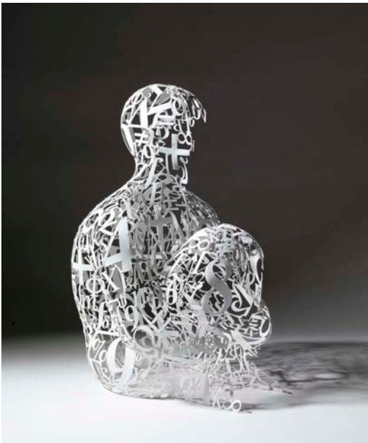
Jaume Plensa Alchemist (study) Teknik: Painted iron and tin År: 2010