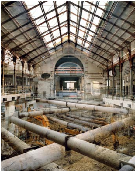
Stéphane Couturier Série "Melting Point" - 104- Photo n° 2 - 104 rue d'Aubervilliers – Paris 19 Teknik: C-print