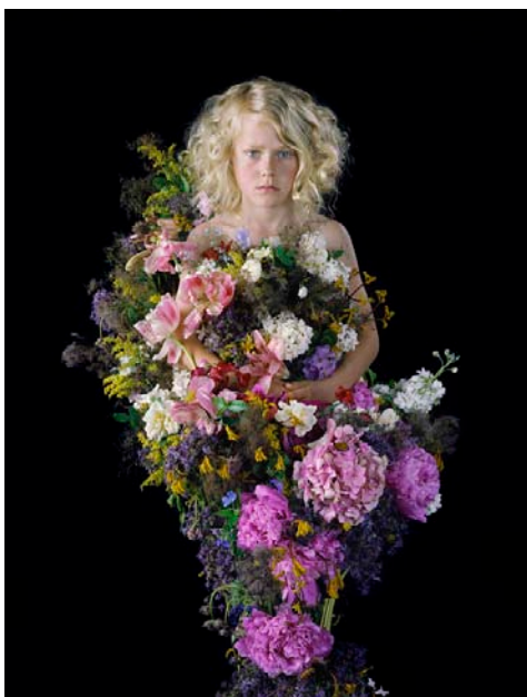
Nathalia Edemont Forget Me Not Teknik: C-print mounted to glass in a black wooden frame År: 2011