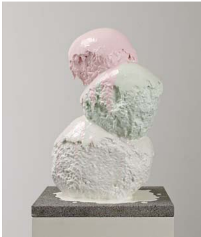
Hans Isaksson Utan titel Teknik: Aluminium, kaltfärg År: 2011