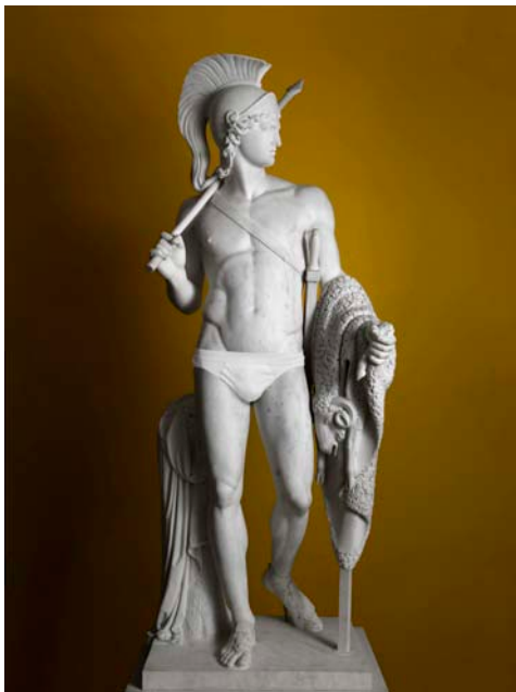
Michael Elmgreen & Ingar Dragset Jason (Briefs) Teknik: Laserchrome color print mounted on 4 mm aluminium År: 2009